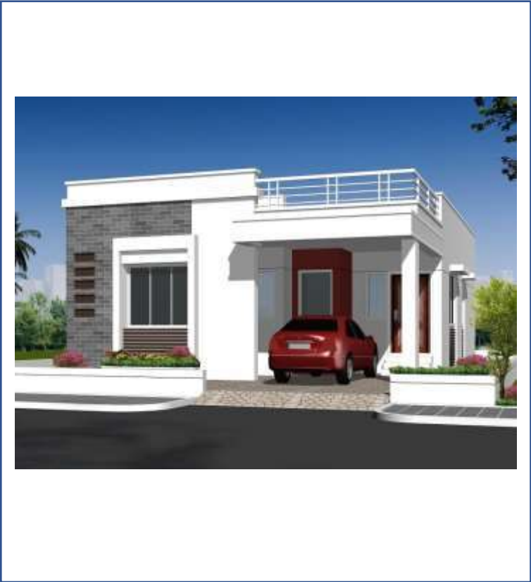
SAMPLE ELEVATION DESIGN 4BHK